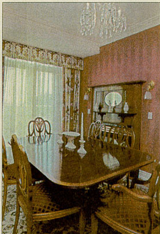
RICH HUE: A dark rose wallpaper went into the dining room, a perfect foil for the mahogany table and chairs.

A lovely dark rose wallpaper went into the dining room. The hue is not only a period colour, but a