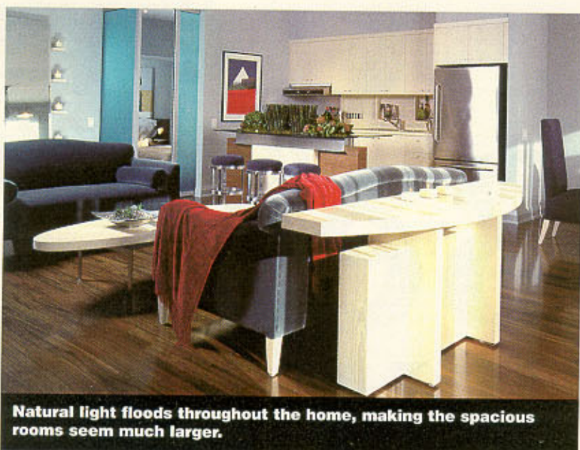
Natural light floods throughout the home, making the spacious rooms seem much larger.

The Beverley stretches along the street block and wraps around onto Phoebe. Of the three buildings, the Beverley comprises the most number of residences, 160, and stands tall at nine storeys, with a five-storey wing at its north. The suites range in size from 588 to 1,700 square feet. Prices here start at $136,000 for a one-bedroom suite.